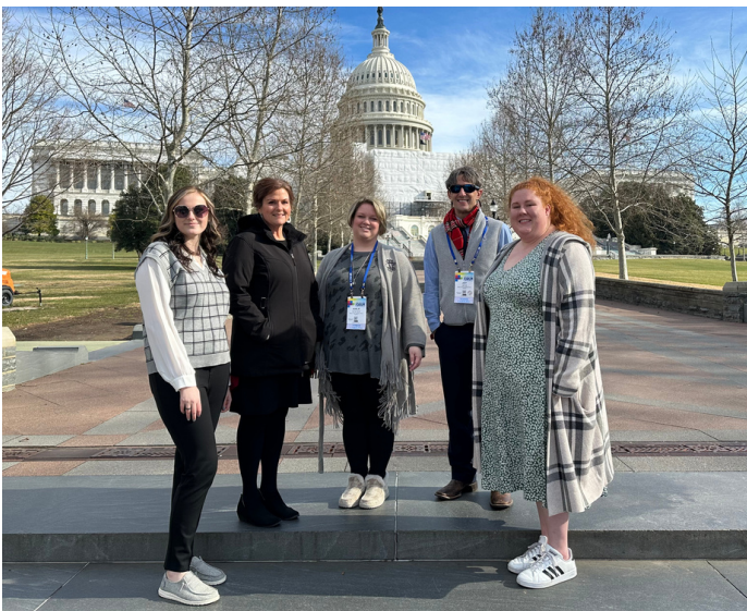
Wilson County Substance Prevention Coalition staff picture

Recovery Concepts Community Center (RC3) is a community recovery center and an initiative of The Wilson County Substance Prevention Coalition, created in 2017. This community center is for those working to sustain and maintain their recovery from substance use disorders can visit the center to take part in educational opportunities, group meetings, social events, or just to hang out in a place that is recovery informed, friendly, and healthy.