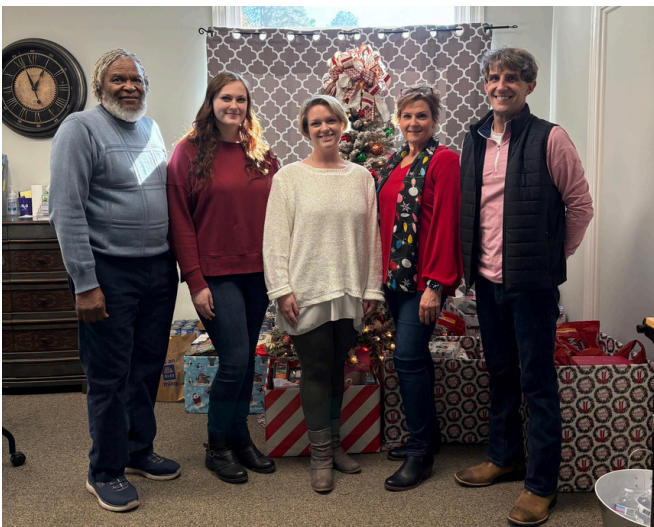
Wilson County Substance Prevention Coalition staff picture

Recovery Concepts Community Center (RC3) is a community recovery center and an initiative of The Wilson County Substance Prevention Coalition, created in 2017. This community center is for those working to sustain and maintain their recovery from substance use disorders can visit the center to take part in educational opportunities, group meetings, social events, or just to hang out in a place that is recovery informed, friendly, and healthy.