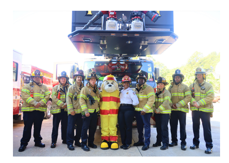
Wilson Fire/Rescue Services staff

We embrace the challenges and opportunities of providing these services in a fast-pace and complex environment. Through training, innovation, and a data-driven decision-making lens, we are able to remain in a constant state of improvement. We will continue to mold and shape our services to meet the ever-changing needs of this community. We will also continue to seek more effective and efficient means of delivering our services.