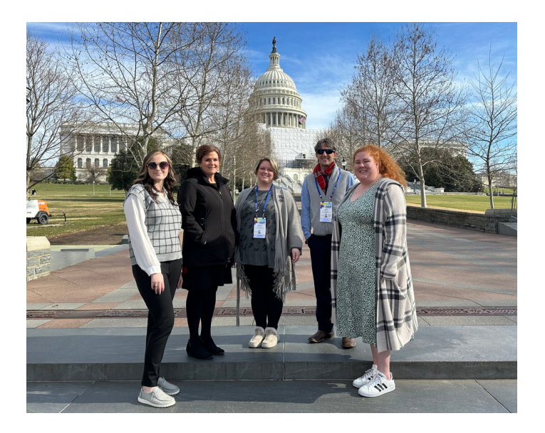
Wilson County Substance Prevention Coalition staff picture

Recovery Concepts Community Center (RC3) is a community recovery center and an initiative of The Wilson County Substance Prevention Coalition, created in 2017. This community center is for those working to sustain and maintain their recovery from substance use disorders can visit the center to take part in educational opportunities, group meetings, social events, or just to hang out in a place that is recovery informed, friendly, and healthy.