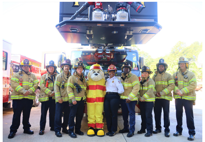
Wilson Fire/Rescue Services staff

We embrace the challenges and opportunities of providing these services in a fast-pace and complex environment. Through training, innovation, and a data-driven decision-making lens, we are able to remain in a constant state of improvement. We will continue to mold and shape our services to meet the ever-changing needs of this community. We will also continue to seek more effective and efficient means of delivering our services.