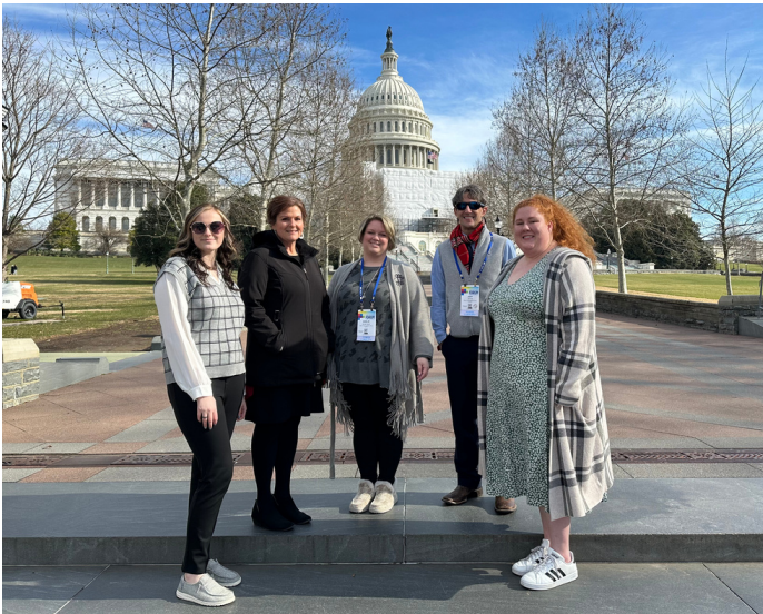
Wilson County Substance Prevention Coalition staff picture

Recovery Concepts Community Center (RC3) is a community recovery center and an initiative of The Wilson County Substance Prevention Coalition, created in 2017. This community center is for those working to sustain and maintain their recovery from substance use disorders can visit the center to take part in educational opportunities, group meetings, social events, or just to hang out in a place that is recovery informed, friendly, and healthy.