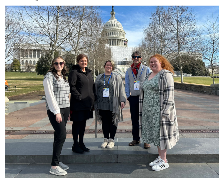
Wilson County Substance Prevention Coalition staff picture

Recovery Concepts Community Center (RC3) is a community recovery center and an initiative of The Wilson County Substance Prevention Coalition, created in 2017. This community center is for those working to sustain and maintain their recovery from substance use disorders can visit the center to take part in educational opportunities, group meetings, social events, or just to hang out in a place that is recovery informed, friendly, and healthy.